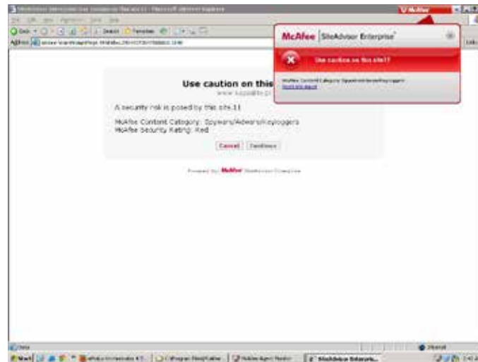
Figure 3. McAfee SiteAdvisor Enterprise blocks access to unwanted websites based on custom blacklists and whitelists.

McAfee Web Filtering for Endpoint is a module enabled in McAfee SiteAdvisor Enterprise, allowing administrators to define a user's browsing environment based on site content categories and create detailed reports on web usage. This ensures that internet usage policy is enforced when a user is both on or off the corporate network.